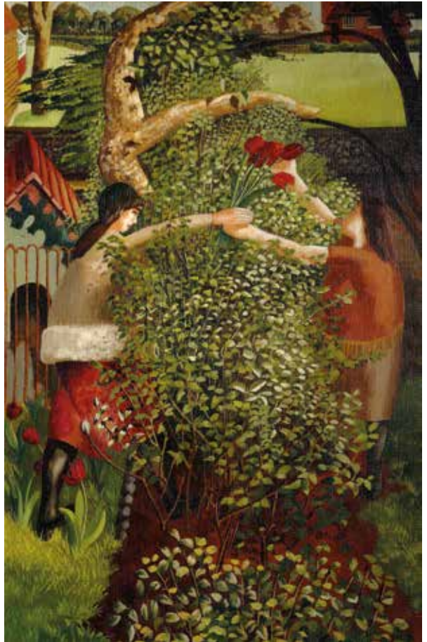
Neighbours, 1936 Stanley Spencer Gallery, Cookham.

"Stanley Spencer was before all else a poet for whom the natural beauty of the world—meadows, gardens, trees in blossom, rivers—was the primary fact" Guy Davenport